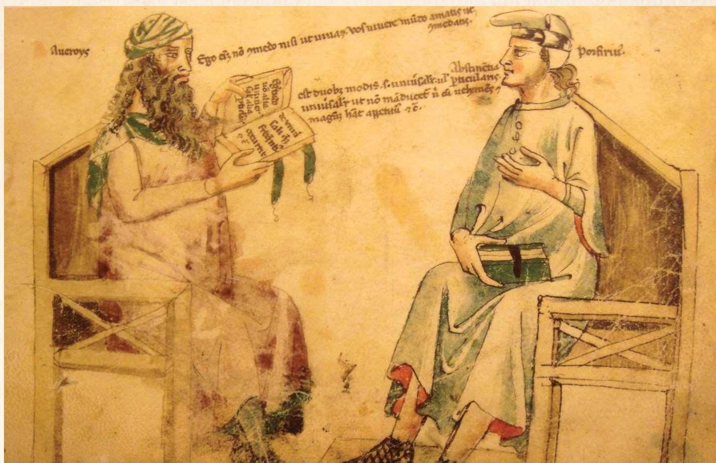
Image: Imaginary debate between Averroes And Porphyry, Monfredo de Monte Imperiali "Liber de herbis", 14th century. Reproduction in "Inventions et decouvertes au Moyen-Age", Samuel Sadaune. PD-Old-100 Wikimedia Commons.

respect to health; while physical exercise naturally produces consumption of what has been accumulated – depletion – food and drink restore what has been emptied – repletion". In this healthy equilibrium, between physical exercise and diet, lies the conservation of health.