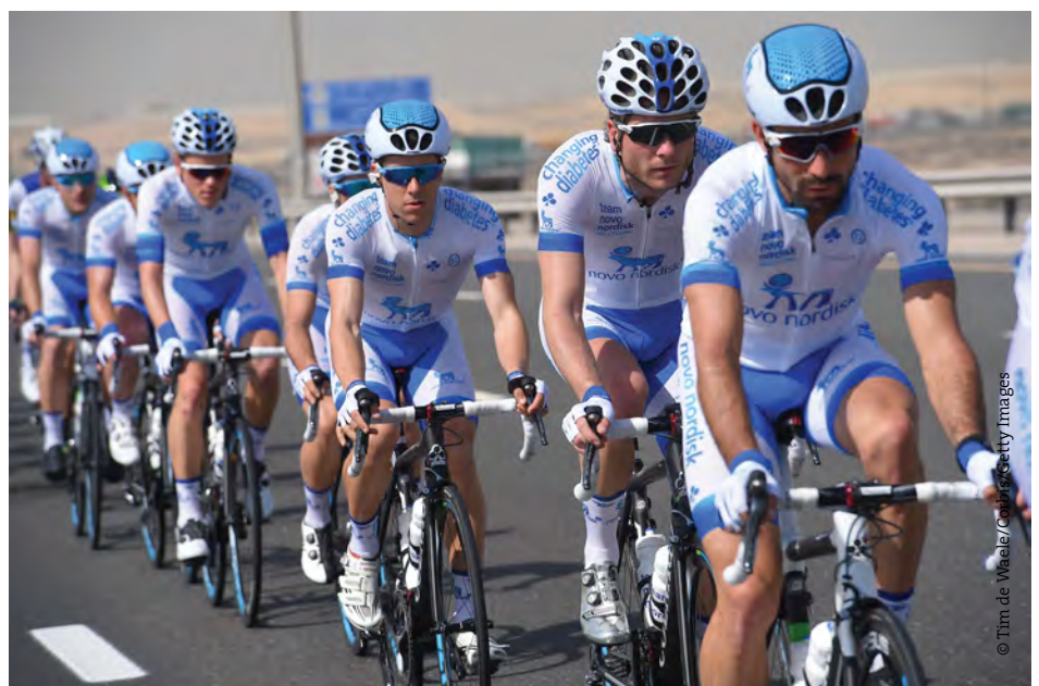
Image 4: Professional cycling team Team Novo Nordisk, consisting entirely of athletes living with diabetes.

Continuous glucose monitoring (CGM) systems are routinely used by the team to track glucose trends during training and racing, allowing athletes and clinicians to adjust carbohydrate intake and insulin dosing in real time, and have fundamentally changed diabetes management in sport. Real-time glucose data allows clinicians and athletes to observe metabolic trends during exercise 9 . Time-in-range (70–180 mg/dL)