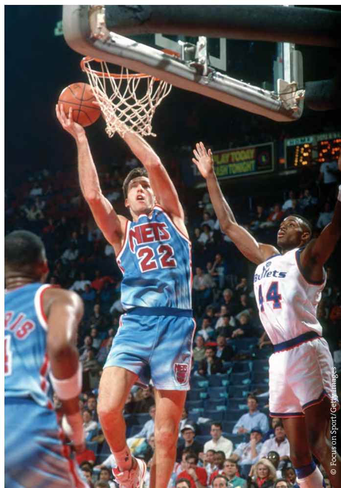
Image 6: Former NBA player Chris Dudley, who played 16 seasons in the National Basketball Association while living with type 1 diabetes.

Former NBA player Chris Dudley, who competed with type 1 diabetes, highlights the safety considerations required in contact sports. Hypoglycemia during competition may mimic concussion, fatigue, or neurological impairment. Symptoms such as confusion, impaired coordination, and slowed reaction time can resemble head injury presentations, making rapid glucose assessment essential