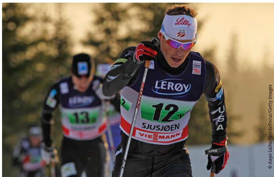
Image 2: Kris Freeman competing in the men's 4x10km Cross Country Skiing Relay during the 2011 FIS World Cup in Sjusjoen, Norway.