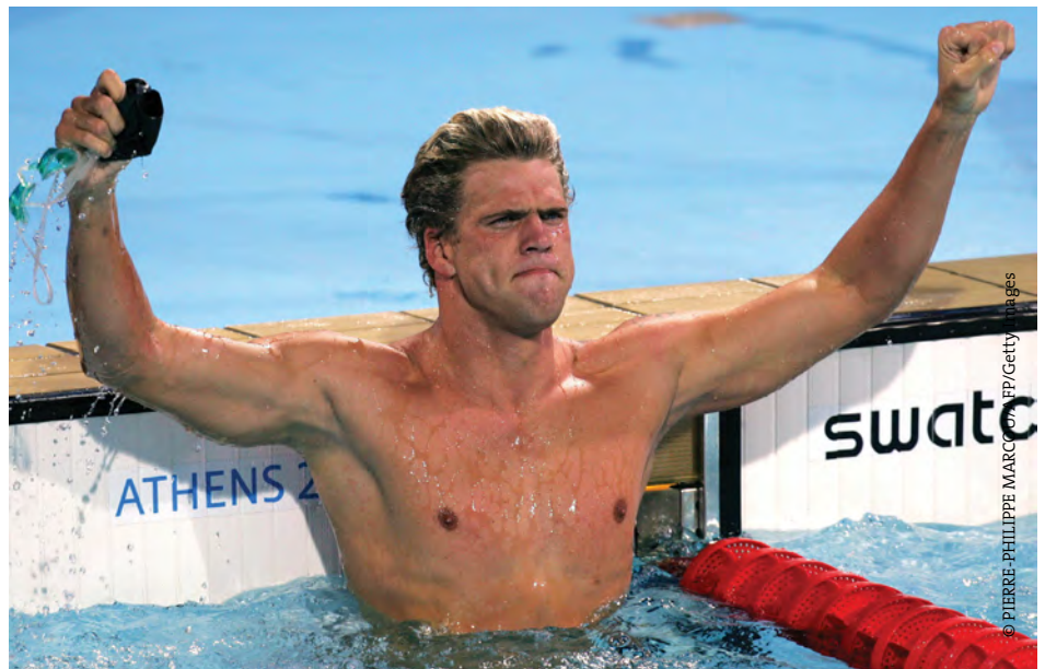
Image 1: Gary Hall Jr. celebrating after winning the gold medal in the men's 50 m freestyle at the 2004 Olympic Games in Athens.

Rare forms of diabetes may also require insulin therapy in athletes. These include monogenic diabetes (e.g., MODY) and secondary diabetes resulting from pancreatic disease, medications, or