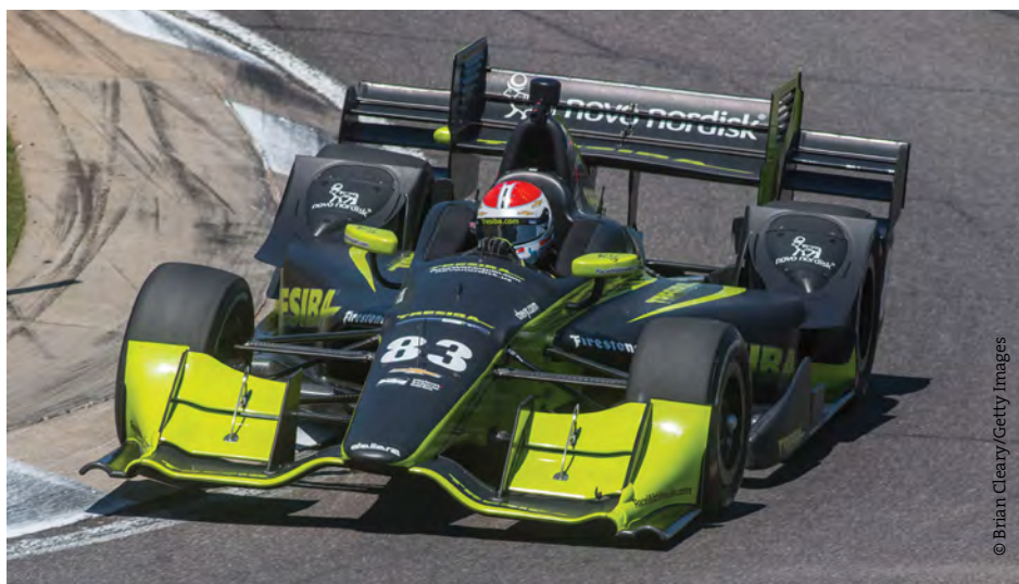
Image 5: IndyCar driver Charlie Kimball competing at the Honda Indy Grand Prix of Alabama.

has emerged as a clinically meaningful indicator of glycemic variability 4 . Unlike HbA 1c , which reflects average glucose levels over several months, time-in-range provides insight into day-to-day fluctuations that directly affect training and performance.