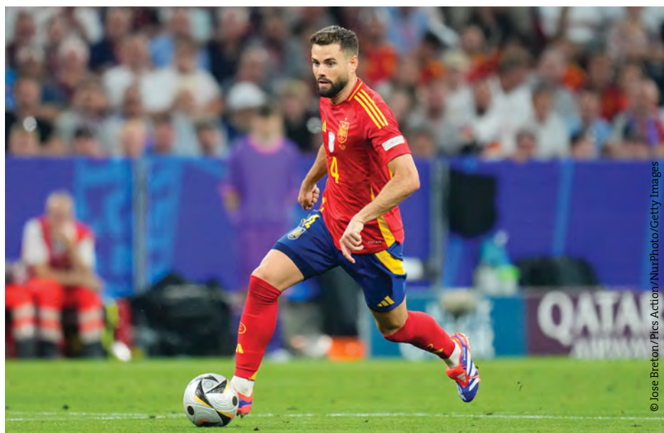
Image 3: Nacho Fernández, a professional footballer for Real Madrid and the Spanish national team, lives with type 1 diabetes.