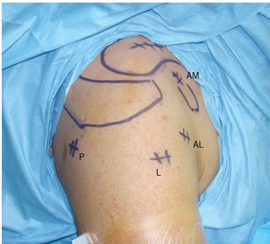
Figure 2: Portals applied in the arthroscopic surgery for AC separations. P=primary posterior portal, L=lateral subacromial portal, AL=anterior lateral portal, AM=anterior medial portal.

of AC separations. The additional use of CC fixation would protect the integrity of the reconstructed structures, as well as maintain the stability of the AC joint and CC interval during the early healing stage of the reconstructed complex, thus improving the biomechanical characteristics and surgical outcomes.