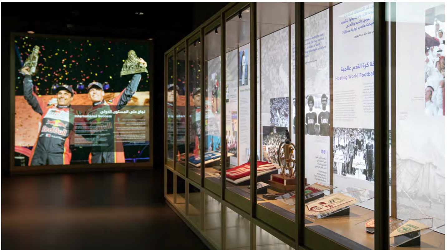
Image: In Gallery 6, the story of Qatar's sporting transformation is presented through its heritage sports, the emergence of football clubs, and key milestones in the nation's sporting history, 3-2-1 Olympic and Sports Museum, Doha, Qatar, 2026.

The outreach department works hand-in-hand with the Ministry of Education and Higher Education, and more than 60,000 school students have visited the museum since it opened its doors to the public. The museum is also home to the region's first public sports library, holding over 5,000 books in its possession that cover everything from sports law and history to fitness and nutrition. The museum also mixes art with sports history through programs like the Cultural Olympiad. In this annual school competition, students pick an object from the galleries and paint it. The initiative recently