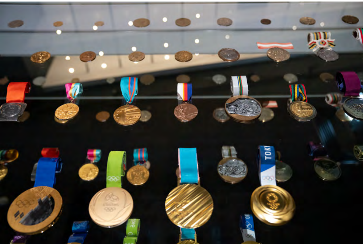
Image: Display of highly sought-after collectibles traditionally traded among athletes as symbols of friendship and exchange, Olympics Gallery, 3-2-1 Olympic and Sports Museum, Doha, Qatar, 2026.