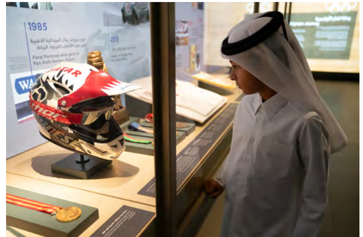
Image: A young boy admires his father's motorbike helmet displayed in Gallery 5, 3-2-1 Olympic and Sports Museum, Doha, Qatar, 2026.