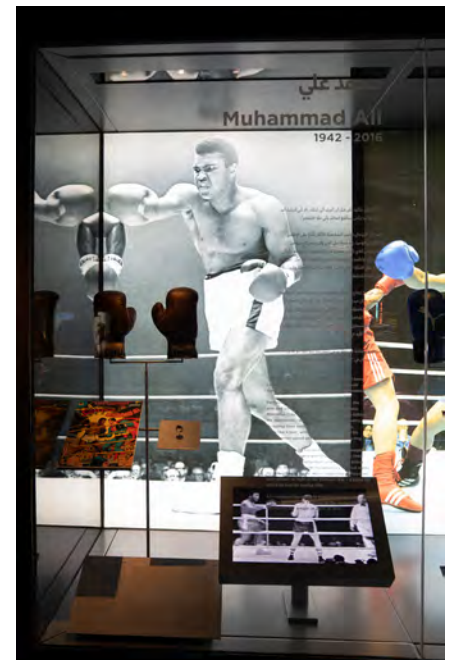
Boxing gloves worn by Muhammad Ali during his historic heavyweight title victory over Sonny Liston are displayed in Gallery 4, 3-2-1 Olympic and Sports Museum, Doha, Qatar, 2026.