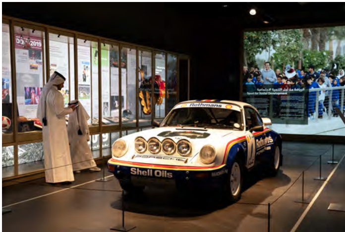
Image: A father and his son reflect on Qatar's sporting development in Gallery 5: Qatar Hosting Nation, 3-2-1 Olympic and Sports Museum, Doha, Qatar, 2026.