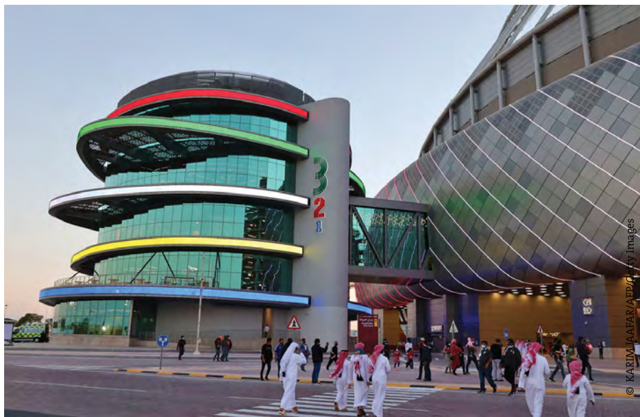
Image: The exterior glass façade of the 3-2-1 Olympic and Sports Museum features the 5 Olympic rings wrapping around its cylindrical form, directly connected to Khalifa Stadium, Doha, Qatar, 2022.

showing where they scored highest. This data, in turn, plays a role in the community. Through a partnership with Aspire Academy and national sports federations, the museum passes high-score profiles to talent scouts. The Activation Zone also works closely with Aspetar, particularly its Nutrition team, to provide families with all the tools and knowledge to implement healthy eating, offering practical advice to help kids avoid junk food and stay active. I was pleased to witness such a meaningful collaboration between the museum and Aspetar.