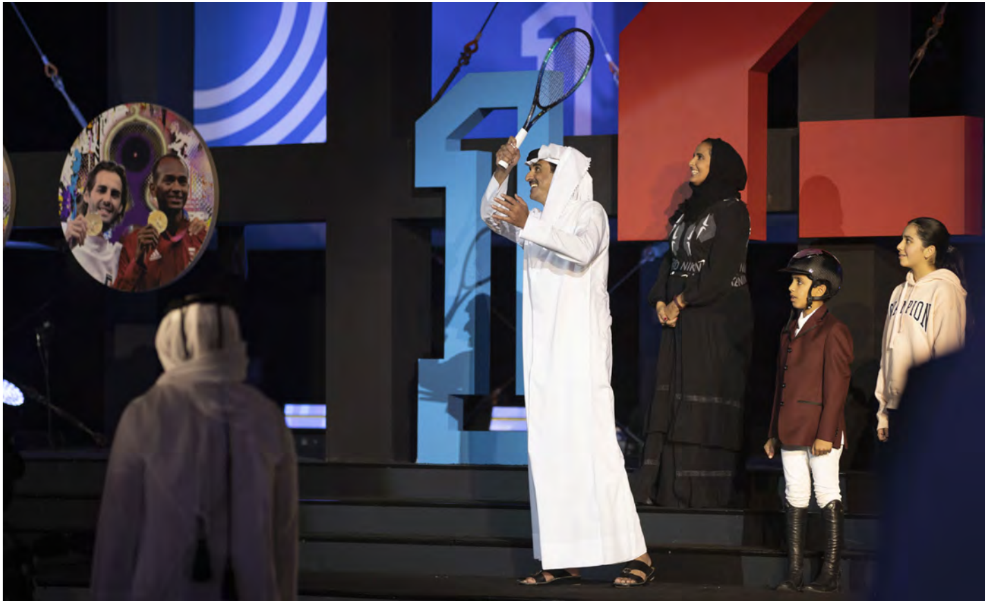
Image: His Highness Sheikh Tamim bin Hamad Al Thani and Her Excellency Sheikha Al Mayassa bint Hamad Al Thani mark the official opening of the 3-2-1 Qatar Olympic and Sports Museum with a ceremonial tennis ball toss, Khalifa Stadium, Doha, Qatar, 2022.

Qatar was collecting legacy items from all kinds of events, including regional tournaments, non-Olympic sports, and the Paralympics. The name that was settled on was "Olympic and Sports Museum." As for the name 3-2-1, it is also deeply symbolic. It represents the familiar countdown at the start of any race: "On your marks, get set, go." Furthermore, the lines on the logo are placed to mimic the lanes on a running track. The branding was so clever that when it was sent to the IOC headquarters for approval, there were rumors that the committee inquired if they could acquire the logo for their own use due to how impressive it was. However, Qatar chose to keep the design, preserving it as a unique symbol of the museum's identity. The project was officially set in motion under the leadership of Her Excellency Sheikha Al Mayassa bint Hamad Al Thani, the Chairperson of Qatar Museums. Slowly but surely, the idea grew from a local archive into a world-class educational institution that directly supports the human development goals of the Qatar National Vision 2030. By March 30, 2022, the museum was officially inaugurated at Khalifa Stadium, marking a major milestone for the country just months before the 2022 FIFA World Cup.