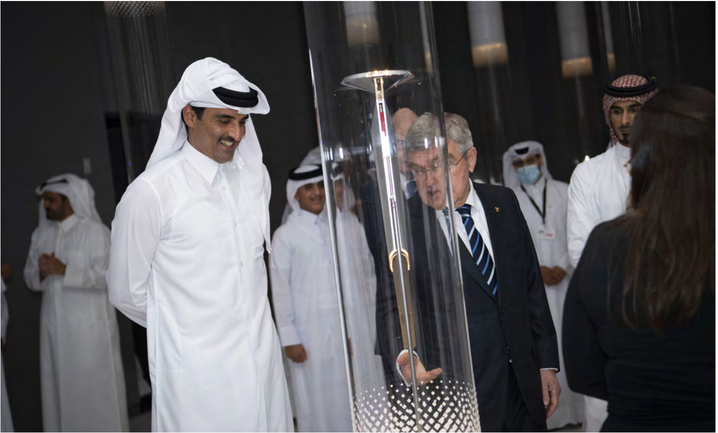
Image: His Highness Sheikh Tamim bin Hamad Al Thani and His Excellency Sheikh Jassim bin Hamad Al Thani, alongside former IOC President Thomas Bach view the collection of Summer and Winter Olympic Games torches, Olympics Gallery at the 3-2-1 Qatar Olympic and Sports Museum, Doha, Qatar, 2022.