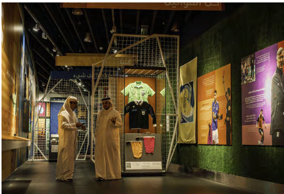
Image: Museum visitors observing a gallery space at the 3-2-1 Qatar Olympic & Sports Museum, Doha, Qatar, 2024.