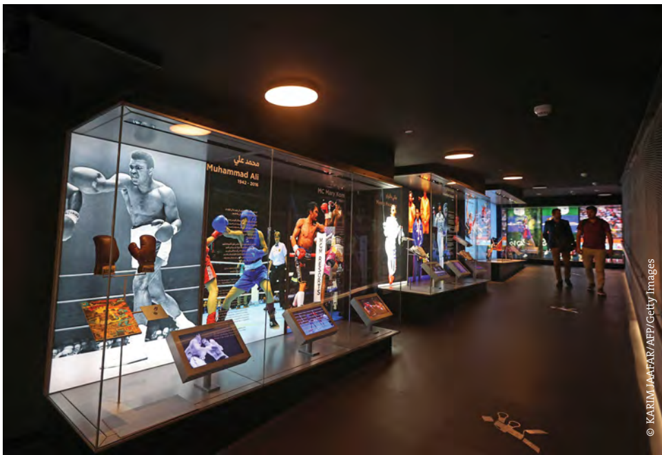
Image: The “Hall of Athletes” showcases the inspiring journeys and achievements of 90 sporting heroes from around the world, spanning a wide range of disciplines, Gallery 4, 3-2-1 Olympic and Sports Museum, Doha, Qatar, 2026.