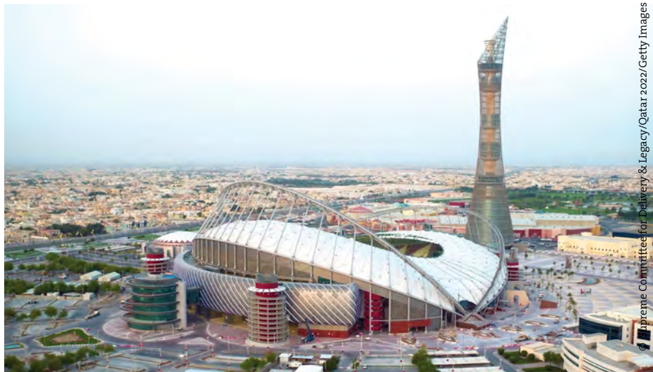
Image: The 3-2-1 Olympic and Sports Museum is located within the Sports City ecosystem alongside Khalifa Stadium, Aspetar Orthopaedic and Sports Medicine Hospital, and Aspire Academy, Doha, Qatar, 2017.

Lastly, the most interactive part of the museum is located in the Activation Zone. I could not overlook the level of detail that had gone into curating this area. It became evident that the museum functions as an educational institution rather than merely a passive exhibition space. This interactive area is deliberately designed to get people moving and even help discover early sports talent for future sporting potential. The zone features 18 interactive machines that test physical fitness, speed, agility, and motor skills. When young visitors enter, they are given a smart wristband to track their performance. At the end of the games, visitors receive a report