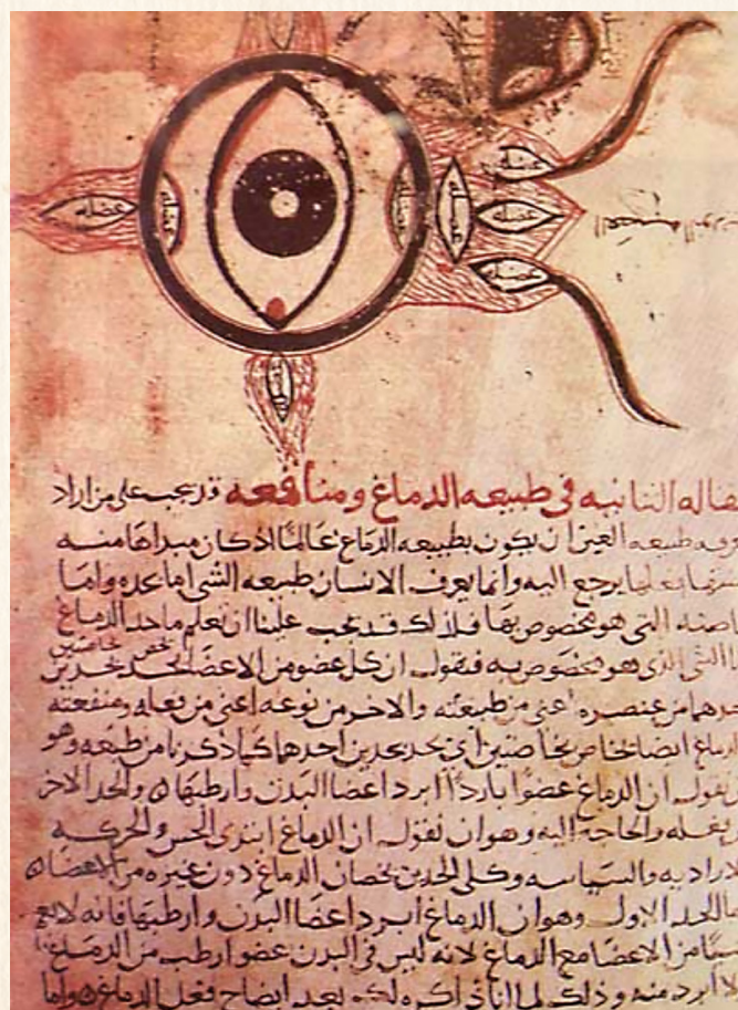
Figure 2: Medical description of the eye by Hunayn Ibn-Ishaq in his Kitab al 'Ashar Maqalat fi 'l 'ayn .