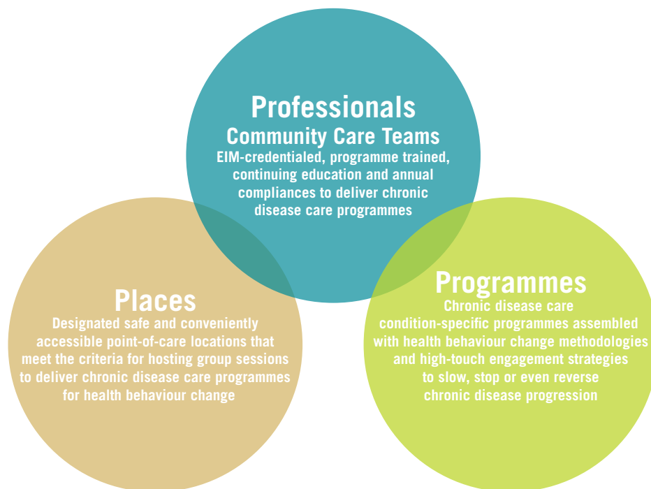
Figure 2: The three key elements of a sustainable community network for physical activity interventions.