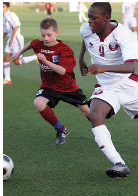
Above: Chronic athletic groin pain is common in football players of all codes

They found that only the open operative group showed any significant